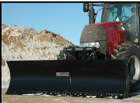
Case IH PUMA Series with LEON Model 2530