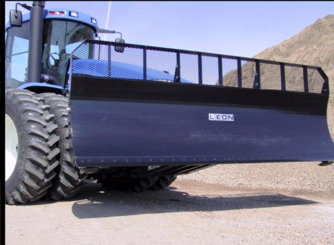
New Holland TJ Series with LEON Model 4000