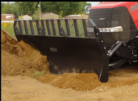
Case 500-550-600 Quad with LEON Model 5000

Thousands of LEON 2WD-FWA-4WD-Track Drive Mount Kits for AGCO, Buhler Versatile, Case, Cat, John Deere, Kubota, New Holland and Other Major Brands... Call Us Today!