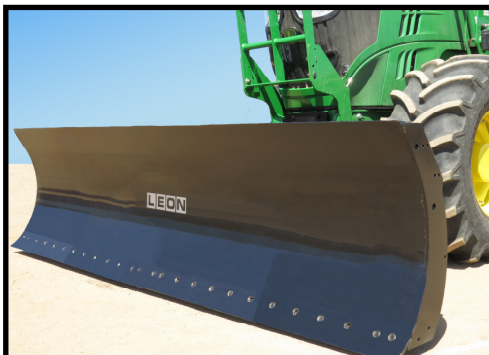
John Deere 6R Series with LEON Model 3530