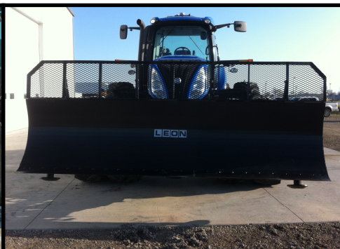
New Holland T8 Series with LEON Model 3530