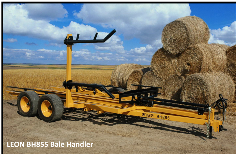
LEON BH855 Bale Handler