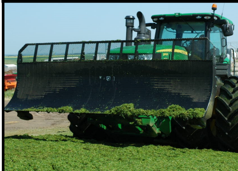
John Deere 9R Series with LEON Model 4000-5000