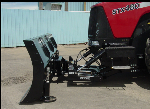
Case 480-485-530-535 with LEON Model 4000