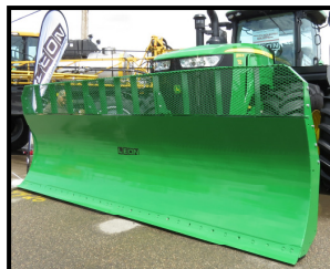
SPECIAL Custom Colored LEON Model 5000 Series Dozer Blade on John Deere 9R Series Tractor. (Tractor courtesy of South Country Equipment, Regina SK.)