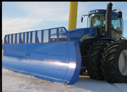
New Holland T9 Series with LEON Model 4000