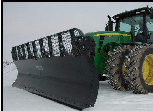
John Deere 8R Series with LEON Model 3530