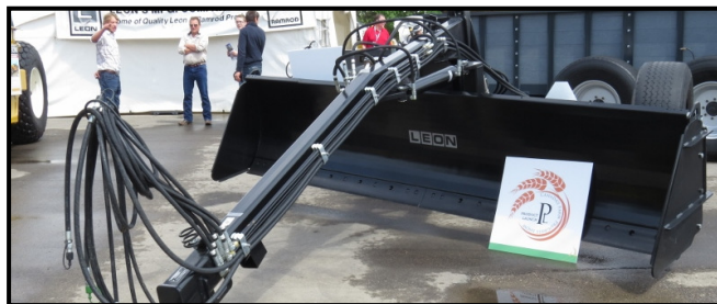
Unveiling NEW Products—NEW LEON GZ300 '8 Way' Pull Scraper... one of many NEW LEON products showcased at Western Canada's Farm Progress Show.