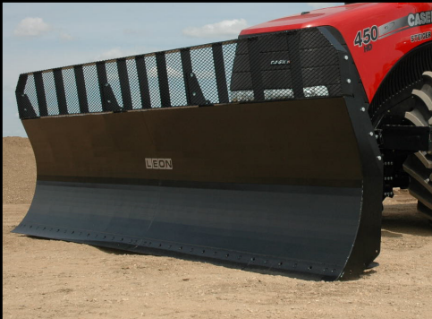
Case 450-500-550 with LEON Model 4000