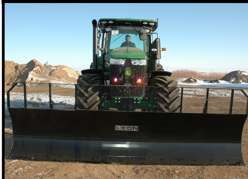
John Deere 7R Series with LEON Model 3530