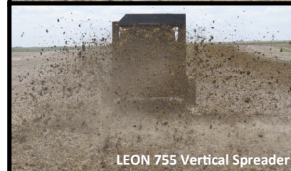
LEON 755 Vertical Spreader