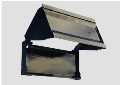
4 in 1 Bucket