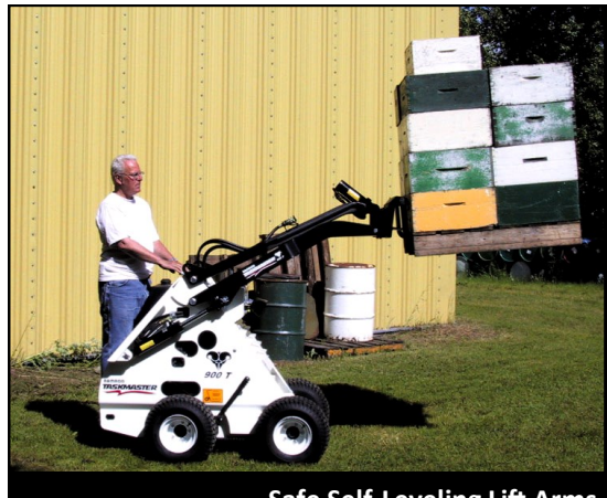
Safe Self-Leveling Lift Arms

STANDARDS COMPLIANT - North America and 'EU' Certified.