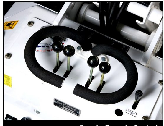
Easy to Operate Controls