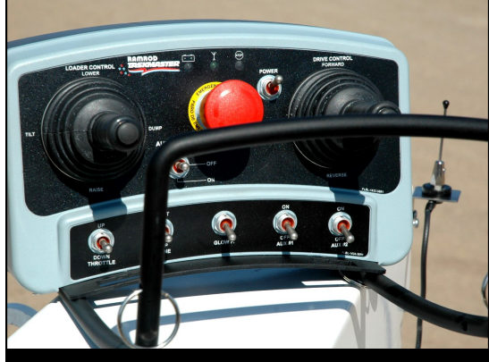
Remote Controlled Units Available