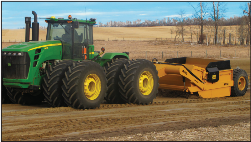
John Deere 9630W pulls LEON M2050 Land Scraper on land reclamation project

...In addition to large floatation tires, the combination of 116" (294 cm) bucket width, high ground clearance, and variable depth control makes loading fast and easy on LEON M1700 and M2050 Models.