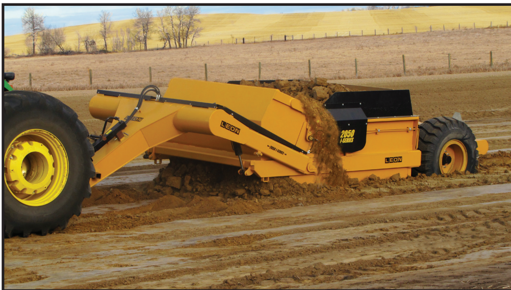
LEON M2050 I-Series Straight Hitch Scraper working at Leggett Farm in Edgerton, AB

Considering all the criteria involved, the LEON line has evolved and changed to of-