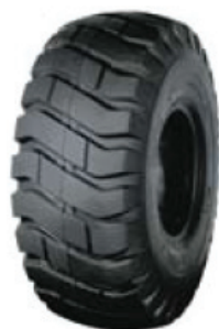
Large Floatation Super Grip Tires

Some units can also be equipped with Large Floatation 23 ½ x 25 Super Grip Tires to aggressively guide the unit through the most challenging terrain. The extra width and superior tire height of LEON tire options are a noticeable advantage over other multi tire scrapers due to their superior climbing performance on both wet and soft farmland.