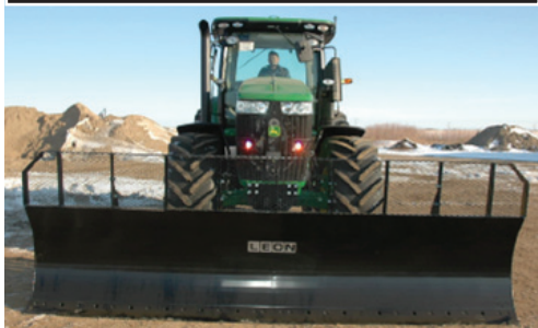
LEON M2530 on John Deere 7R-Series