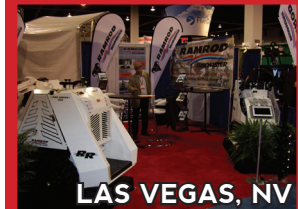
LAS VEGAS, NV

Supporting our LEON Customers in anyway we can.