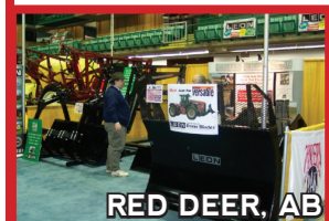
RED DEER, AB

Supporting our LEON Customers in anyway we can.