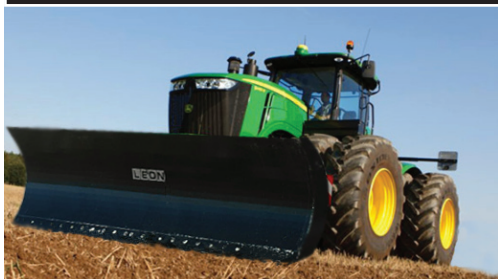
LEON M5000 on John Deere 9R-Series