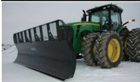
LEON M3530 on John Deere 8R-Series